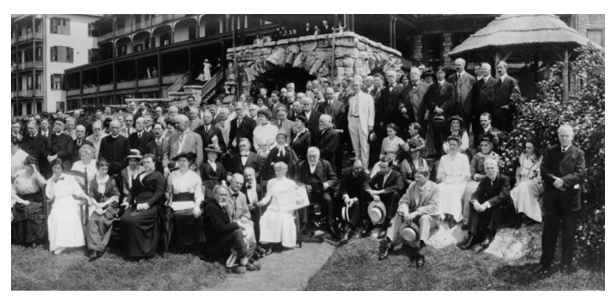
Lake Mohonk Conference on International Arbitration, circa 1915