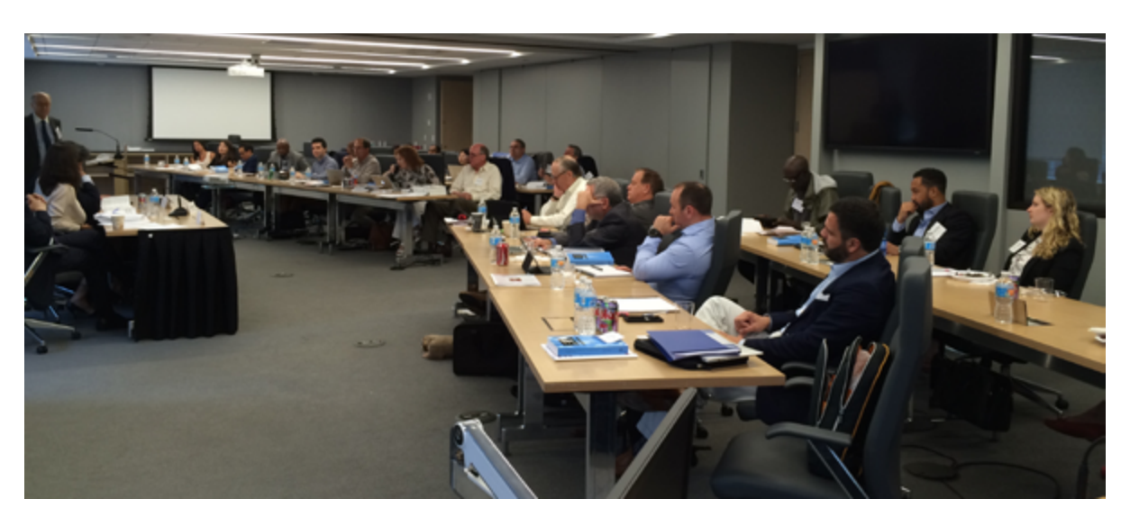
Chartered Institute of Arbitrators (CIArb) NY Branch/Columbia Center for International Commercial and Investment Arbitration (CICIA) Annual Course on International Arbitration, conducted at the New York International Arbitration Center (NYIAC), June 2016